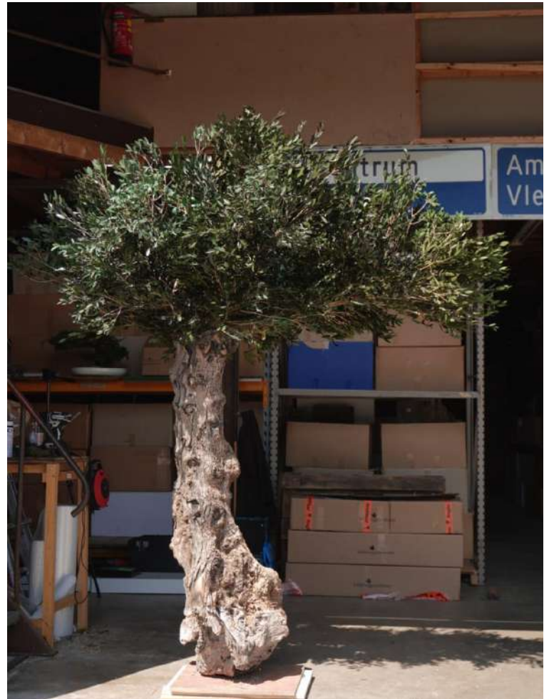
Olive tree, 270 centimeters (H)