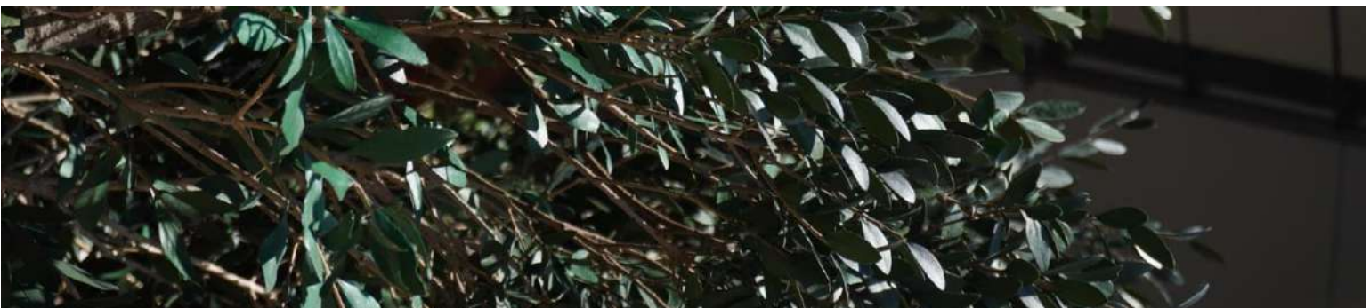
Details of the preserved olive leaves