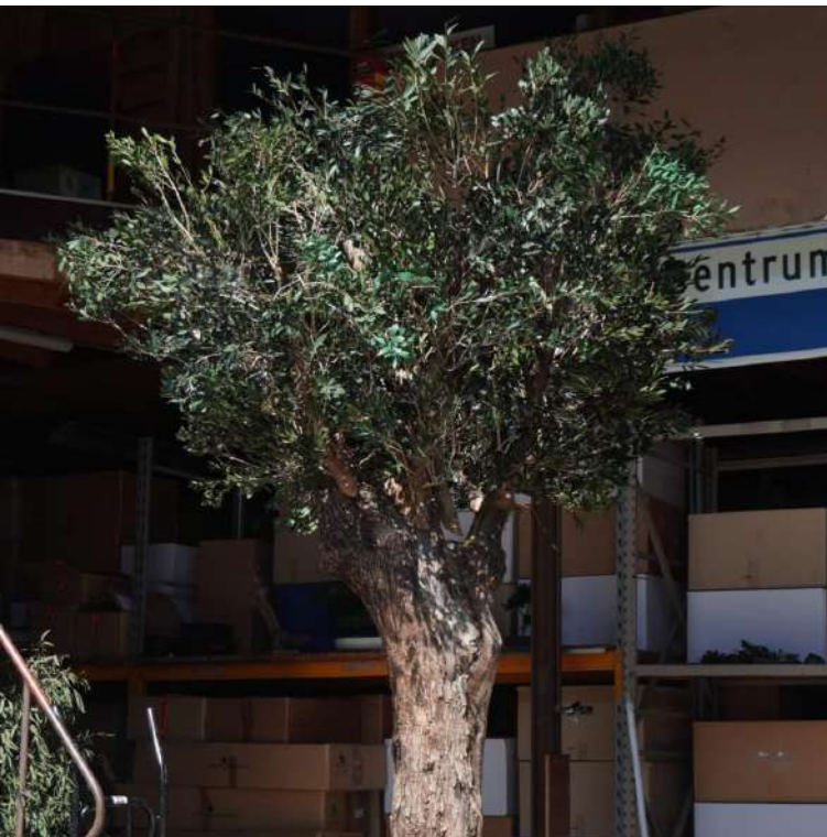
Olive tree 300 centimeters (H)